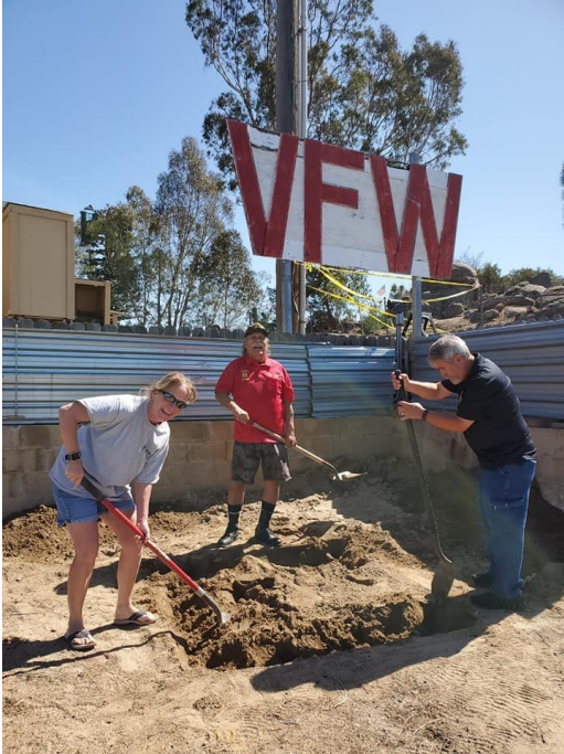
The "Crew" for the annual Alpine BBQ.