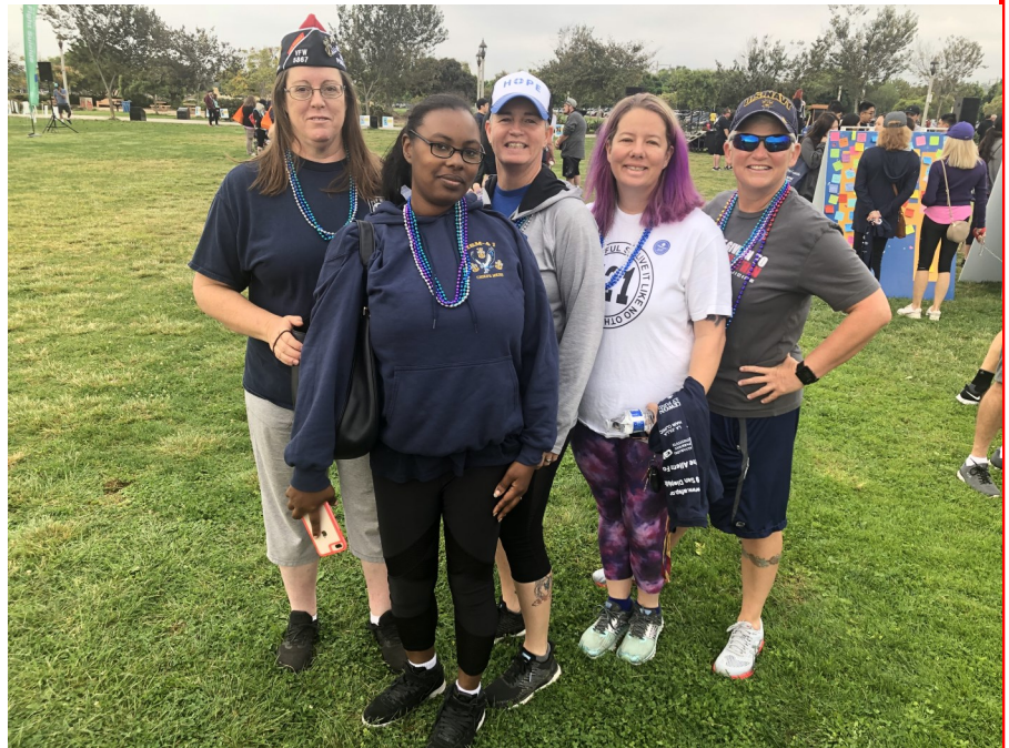
Out of the darkness suicide prevention walk members from post 5867