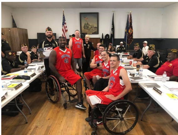
The Wolfpack is a mobility challenged all veteran wheelchair basketball team. See page 9 for more information their upcoming playoff games in San Diego.