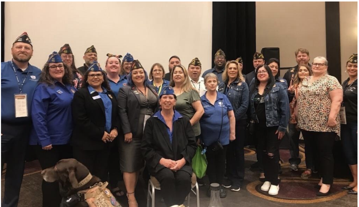
VFW District 1 Members at the Department Convention in Anaheim, CA